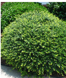
Common Name: Compacta Inkberry Holly Scientific Name: Ilex glabra 'compacta'

Ilex glabra 'Compacta', also called as Compacta Inkberry Holly, is an upright-rounded, compact evergreen shrub with a oval habit. It has the glossy dark green leaves which remain attractive in winter. The Greenish flowers produce black berries if pollinated which display black berries through winter. Compact Inkberry Holly typically grows 3-4' tall and wide at maturity. It thrives in rich, acidic, medium to wet soils and prefers full sun to partial shade. 'Compacta' is effective being used as hedge, shrub border, accent planting, foundation planting, and woodland garden.