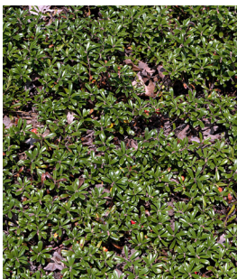
Common Name: Bearberry Scientific Name: Arctostaphylos uva-ursi

Arctostaphylos uva-ursi , commonly known as bearberry, is a low-growing evergreen shrub with trailing branches spreading to form dense mats. The dark green, leathery leaves turn to burgundy color in winter and remain bushy year-round. Small clusters of white-to-pink flowers appear in mid to late spring. Red berries ripen in the fall, which provides good food source for birds. Bearberry typically grows as low as 6-12" and 3-6' wide. It prefers sandy, dry to medium, and well-drained soils in full sun to partial shade. Bearberry makes an attractive ground cover with year-round interest and effective as shrub borders, rock gardens or native gardens.